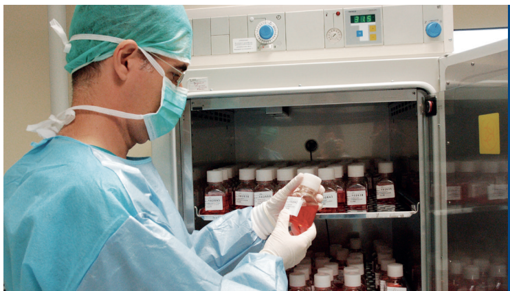
BBMRI.it: Fondazione Banca degli Occhi del Veneto

This years HOBB is entitled “The EXPOntial relevance of Biobanking. Clinical Biobanks for personalized medicine”. From 29 to 31 July 2015, HOBB is held in Milan, my home town