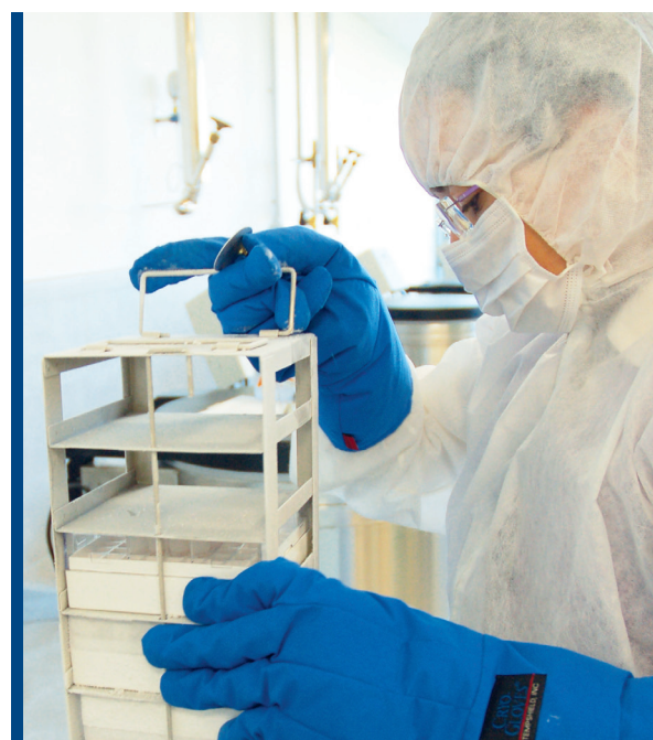
BBMRI.it: Fondazione Banca degli Occhi del Veneto Onlus