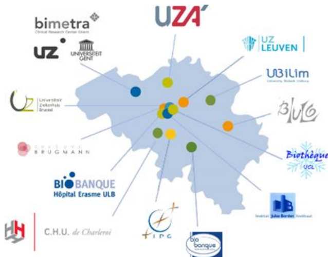
Biobanks of BBMRI.be